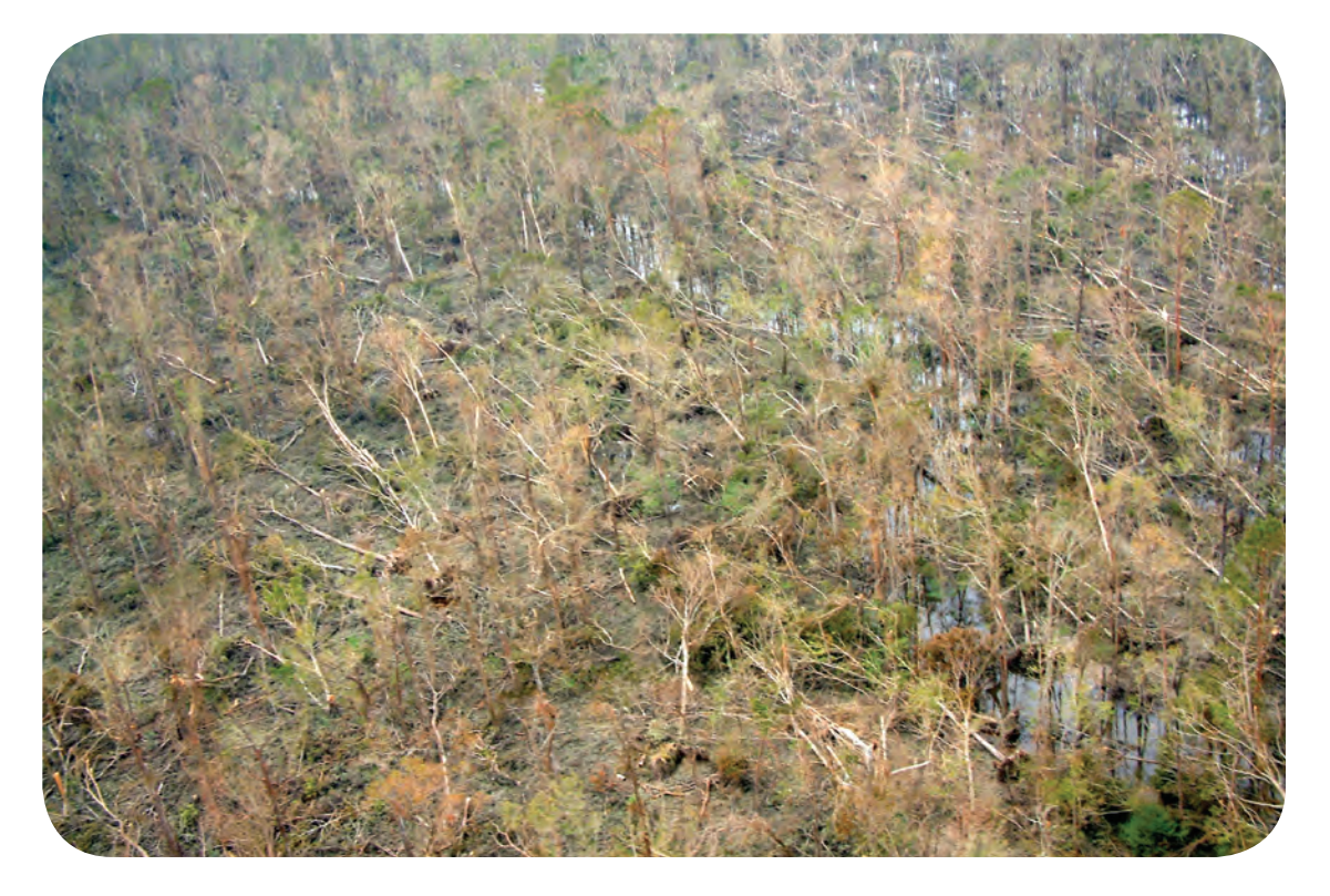
Figure 2. Aerial view of Hurricane Katrina damage in the Pearl River bottoms. The hurricane toppled vast areas of forest and stripped away the canopy foliage, vine tangles, epiphytes, and insects and fruits that migrant landbirds depend on.

Plans for further work should include adding an ecological modeler and geographer to the team and using results from this study to (1) develop models to assess causal relations among environmental variables and bird densities,